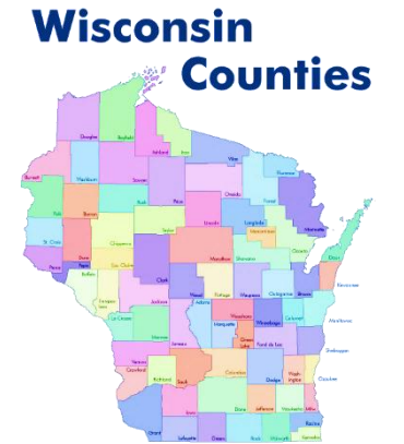
Local Systems of Government & Counties