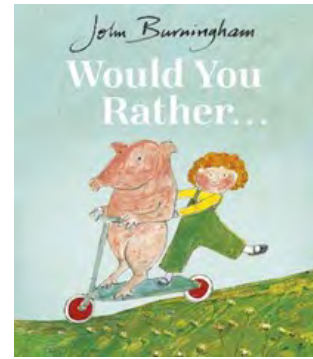
Would You Rather? by John Burningham